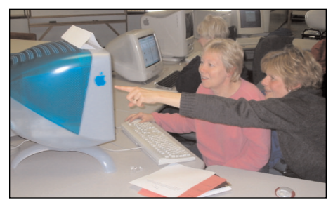
Classroom and office paraprofessionals gain new computer skills.

Plainville teachers and paraprofessionals gathered in January for a day of learning on the state's coldest day in 20 years. While the state fought arctic temperatures, educators in Plainville participated in professional development designed to improve teaching and learning in Plainville Community Schools. The district's professional days are critical to continuous improvement and student achievement in the district and are